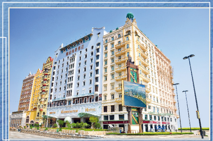
勵庭海景酒店 Harbourview Hotel