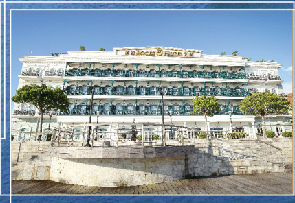
萊斯酒店 Rocks Hotel

訂房熱線 Reservation Hotline : (853) 8799 6666