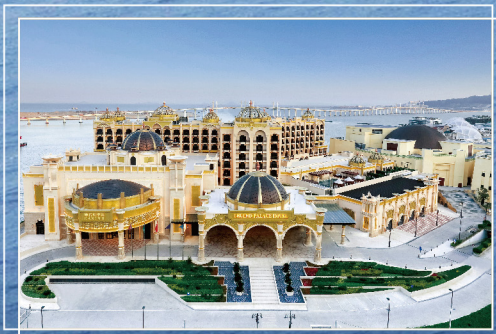
勵宮酒店 Legend Place Hotel